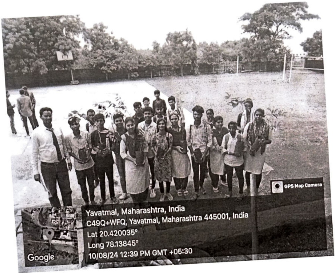
NSS volunteers celebrating with “Ek Ped Maa Ke Naam” on dtd. -10/08/24