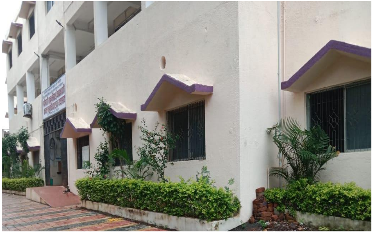
Smt. Nankibai Wadhvani Kala Mahavidyalaya, Yavatmal Images of Ram